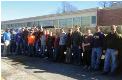
Charles Town Middle FFA celebrated National FFA Week by constructing 33 wooden benches to be donated to the Jefferson County Fairgrounds.