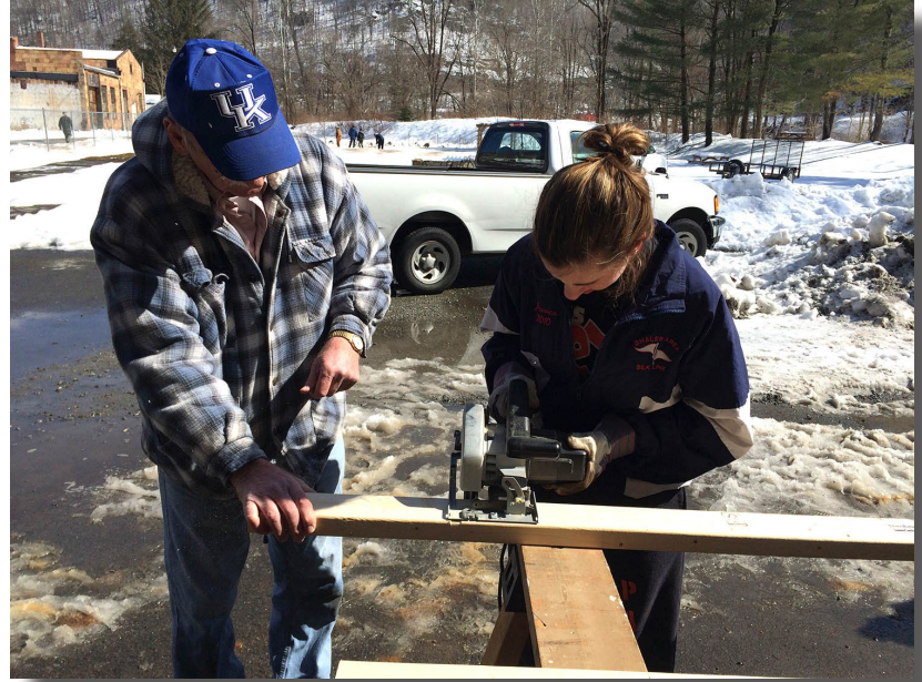
Seventy-five college students from Duquesne, Ohio State, Northwestern, Christopher Newport and Baltimore Universities spent their spring break building the first high tunnel in Mullens.