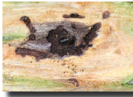
Beetle in gallery with canker.

Its commercial value lies in numerous forms including veneer, lumber and nut products. Final products made of walnut include furniture, cabinets, interior trim, wood carvings, instruments and gun stocks. Nuts from walnut have a variety of uses from food products to polishing compound. Black walnut hulls are used for flavoring and as a health food extract for a variety of skin and intestinal ailments.