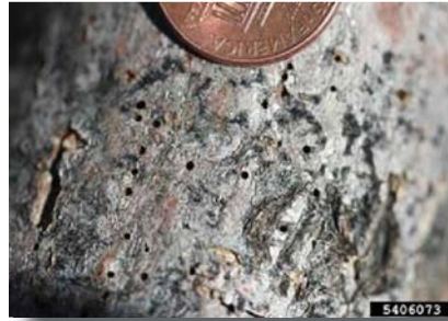
Bark beetles entrance and exit holes.

TCD affects black walnut most significantly but other walnuts such as Arizona walnut, English walnut, California and butternut have shown varying degrees of susceptibility to G. morbida . Black walnut is very valuable to consumers, food processors, industrial processes, harvesters, growers and small businesses.