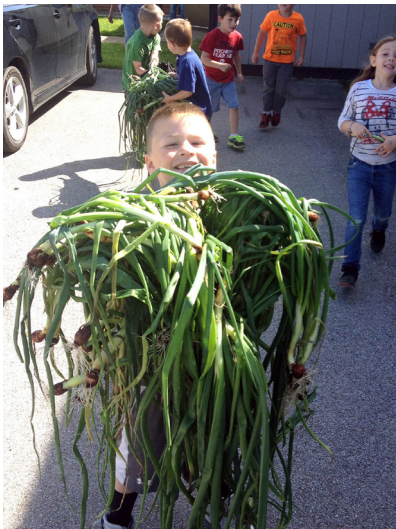
A Hometown Elementary student is overwhelmed by just a small part of their green onion harvest.

George Washington Elementary in Eleanor has had their high tunnel for two years and have also added a new picnic shelter beside the greenhouse so they can munch on their vegetables outside. They recently showed off their homegrown efforts at their Leadership Day. Kindergarteners walked visitors through their growing process and 5th graders showed visitors through the beautiful, open high tunnel. Each grade has a designated bed to grow their vegetables, but they say it's a group effort growing things to make money for their school. Putnam County continues to look for even more Farm to School involvement next school year.