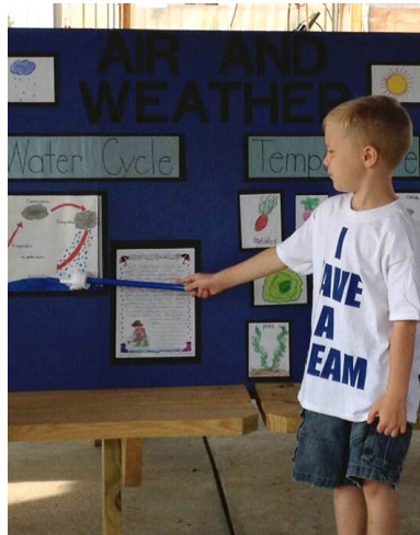
A George Washington Kindergartener walks visitors through the growing cycle in their high tunnel.