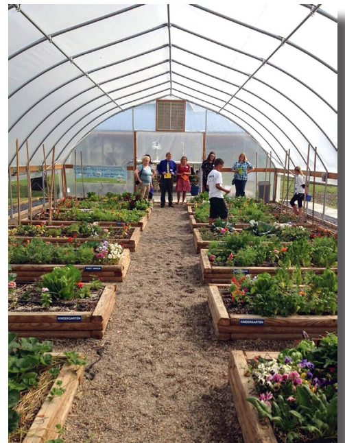
George Washington Elementary 5th graders take visitors on a tour of their successful two year old high tunnel.